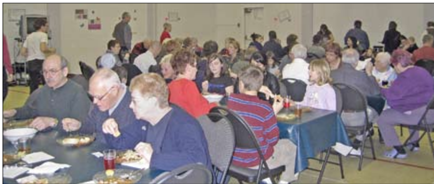
Checking out the results of chili cook-off.

accompaniment by solo guitarist Alex Tanasychuk, all ages settled down to play a wide variety of games, from cards to Guitar Hero . The evening concluded in fellowship and laughter, and with a free-will offering of $555 collected to support two