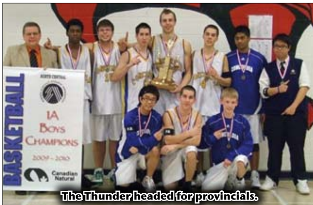
The Thunder headed for provincials.

Earlier, on March 12-13, the Thunder had competed in North Central Zone 1A boys' championships. The first game, with