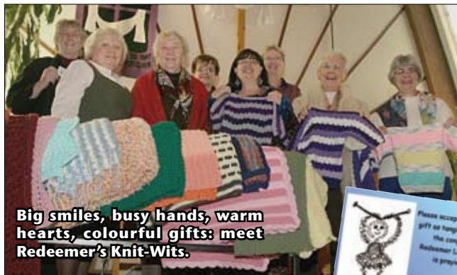
Big smiles, busy hands, warm hearts, colourful gifts: meet Redeemer's Knit-Wits.

Now the Knit-Wits—who meet weekly but also work at home—have expanded their efforts to reach children in