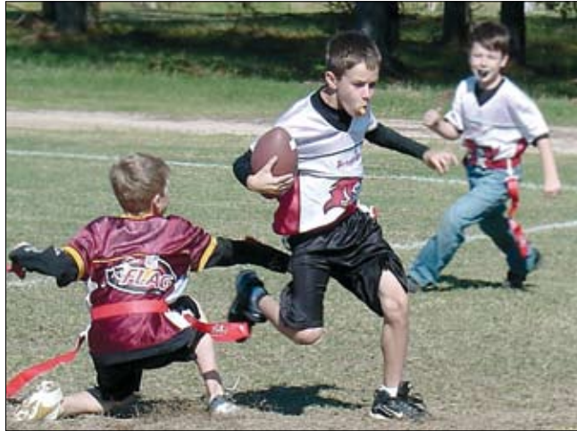
Children enjoy flag football in Cross Point’s church-run league.

Although a young congregation, Cross Point puts a lot of energy and effort into hosting key community events such as its yearly Fall Fest. Essentially it’s a family-friendly Halloween party inside the church. For many families in the community, it means a fun, safe and welcoming environment to come and play games and win some candy! It was an “all hands on deck” kind of event when