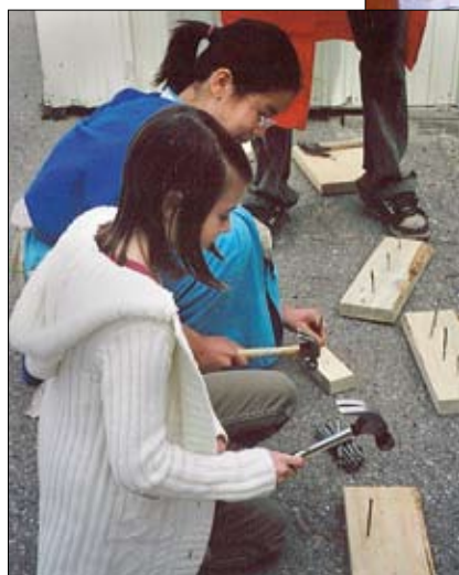
Pounding nails into boards gave a sensory experience of the crucifixion.

27 children (and adults) used their senses to discover an interactive program set up at stations inside the church and staffed by volunteers. Dressed in Biblical costumes, some volunteers served as guides while others told the story of the last days of Jesus' life.