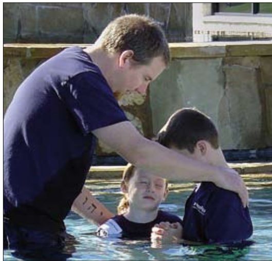
Baptisms in the outdoor heated pool at Katy, Texas.