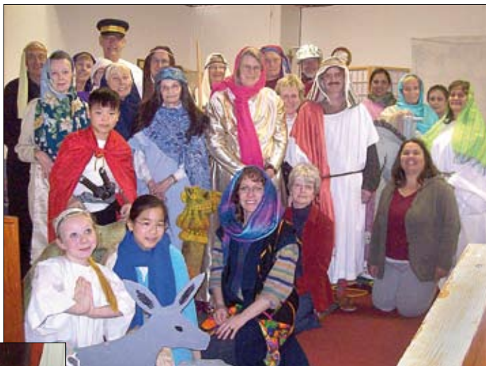
Virtually the entire membership of Redeemer volunteered in some way for the Journey .