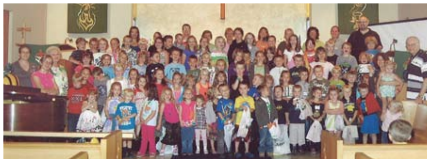
VBS brings many together in Wetaskiwin.

WETASKIWIN, Alta. - Creating a beehive of excitement, Zion Lutheran Church's vacation Bible school had 104 children zipping, zapping and zooming for Jesus.