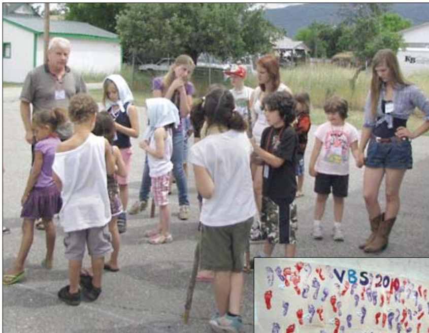
Enjoying outdoor activities (above) and a collage of footprints help illustrate the theme, Follow the Lamb , in Grand Forks.

GRAND FORKS, B.C. - Christ Lutheran's vacation Bible school, July 19-23, proved successful despite two seeming obstacles: the congregation consists of all elderly people and no children attend regular services.