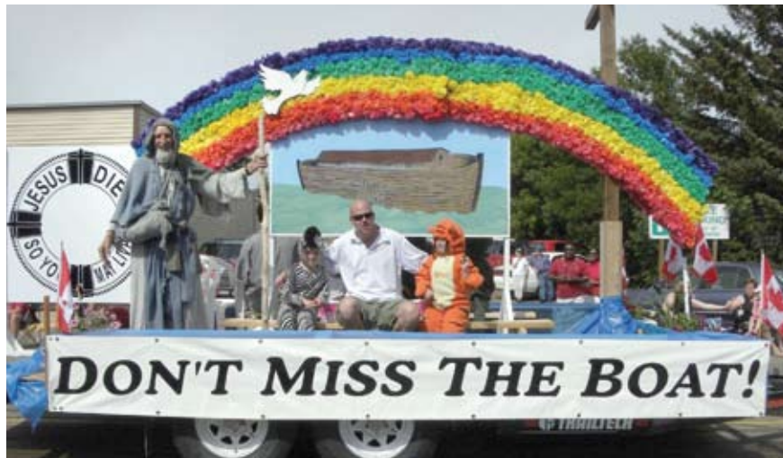
Don't rain on my parade: Noah, the ark and the rainbow at Drumheller museum parade.

DRUMHELLER, Alta. - At the Royal Tyrrell Museum's 25th anniversary, Grace Lutheran Church presented a colourful parade float reminding everyone that the evidence is indisputable: we have a God who intervened in history. Proudly displaying Noah's Ark, the cross and the rainbow, the float appealed to viewers: "Don't miss the boat!"