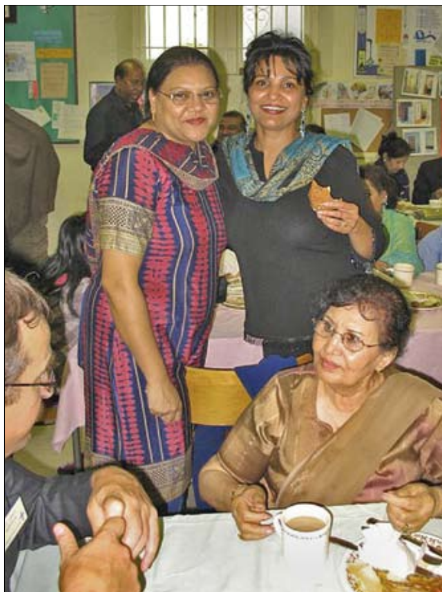
Following the Urdu/English service, worshippers gathered to share foods from both cultures.

Most people stayed for dinner, at which the menu represented both cultures and provided a perfect