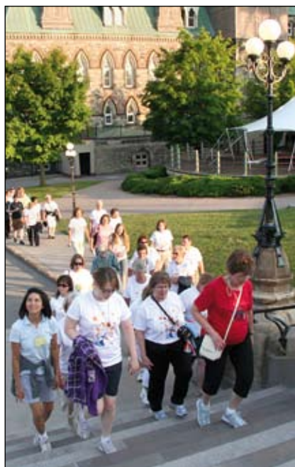
Mission walk route included Parliament Hill.

For the first time the convention was webcast live. Links to videos of the worship service and speakers on the LWMLC website. ( www.lutheranwomen.ca/videos.htm ).