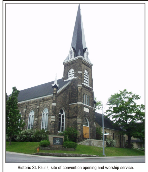
Historic St. Paul's, site of convention opening and worship service.

Today, while Kitchener-Waterloo has become more culturally diverse, it continues to have a significant Lutheran presence. The community is home to seven Lutheran Church—Canada congregations, the head office of the East District of Lutheran Church—Canada, Lutheran Layman's League, Lutheran Bible Translators, Lutheran